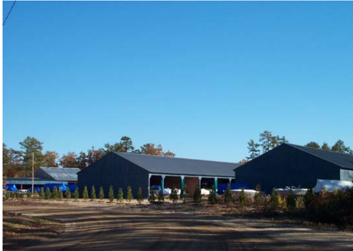
In 1997 Freedom's ZBA mandated that Ossipee Lake Marina plant trees to screen its boat storage operations. Trees were finally planted in the fall of 2002 as a result of persistent efforts by lake homeowner groups working with BBA.

cally rejected the use of Lot 42 for "marina" use. As a result of that ruling the town cannot legally approve marina accessory uses on the property, according to the attorneys for the plaintiffs.