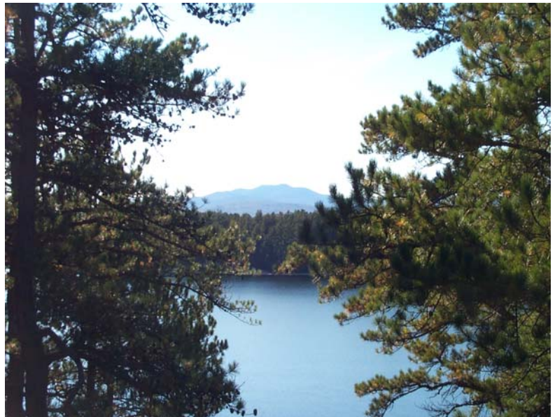
Trees on North Broad Bay frame Mt. Shaw in late autumn. Mt. Shaw, in the Ossipee Mountains, is one of the most familiar sights on the lake.

The Alliance was cited for its work in documenting and ensuring enforcement of violations of environmental and land use