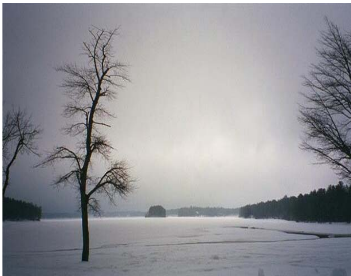
Danforth Pond after a winter storm is.