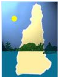
The Alliance is a member of the New Hampshire Lakes Association.