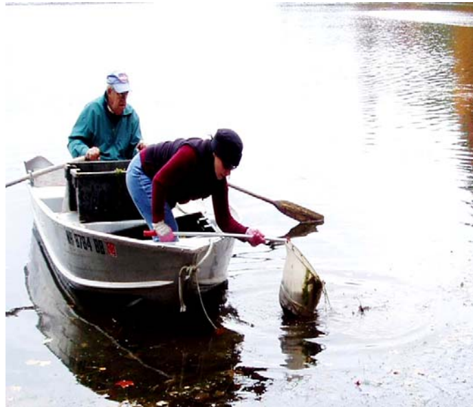
As divers pull milfoil from the bottom, volunteers monitor the surface and shoreline to catch fragments of the weeds with nets. Even tiny fragments can start new infestations.

derived, it will have to be for the long term, since researchers have not found a way to eradicate the weed.