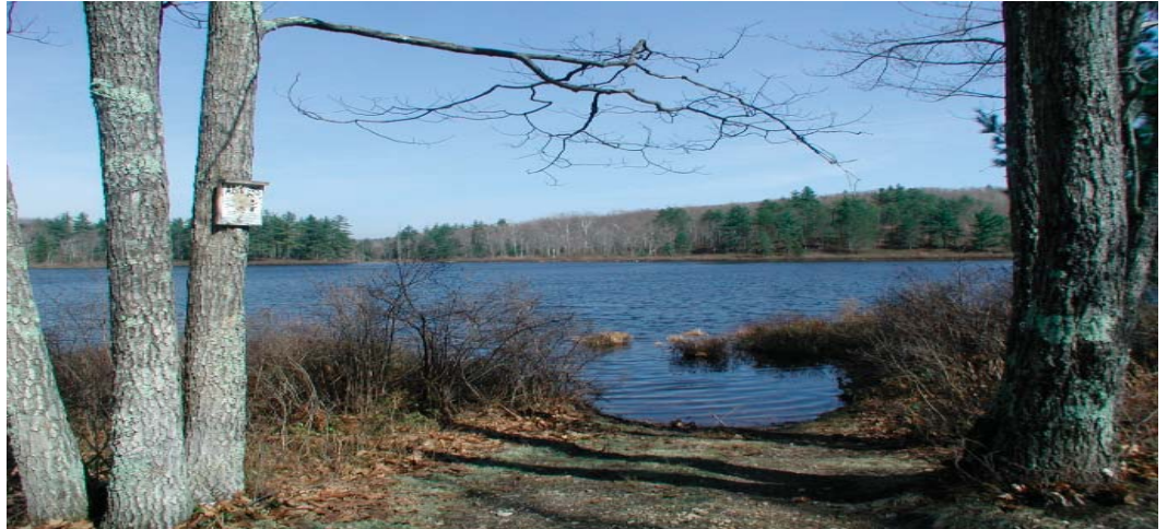
Permanently preserved for recreation and spiritual refreshment, Trout Pond is the focal point of Freedom's community forest.