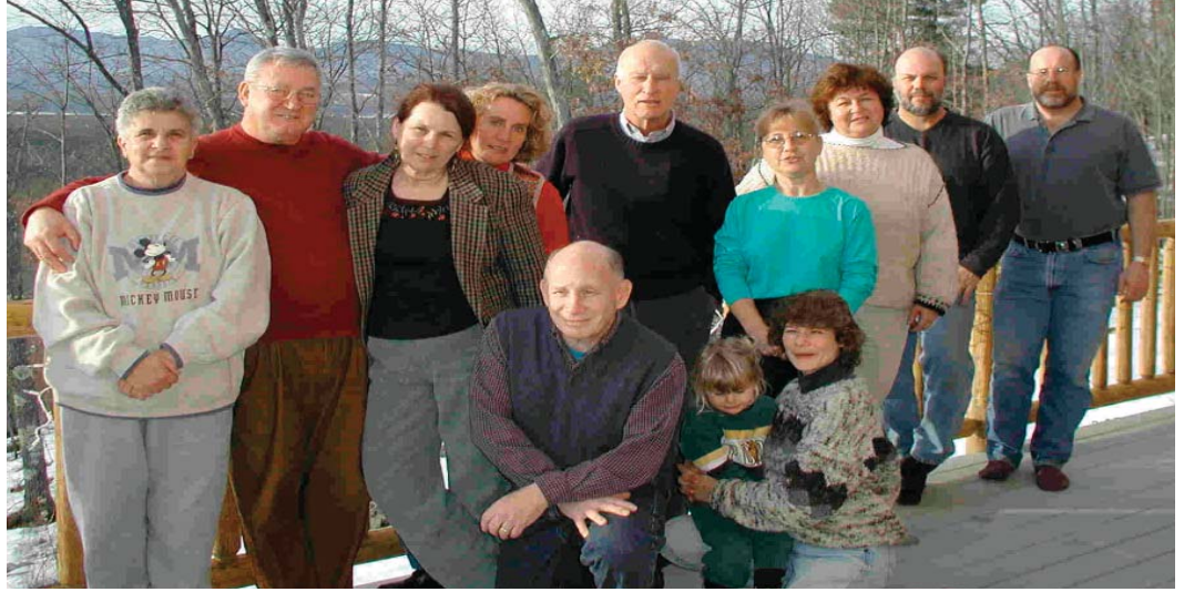
Freedom residents formed the Friends of Trout Pond and raised more than $2 million in one of the region's largest and most successful grassroots initiatives.