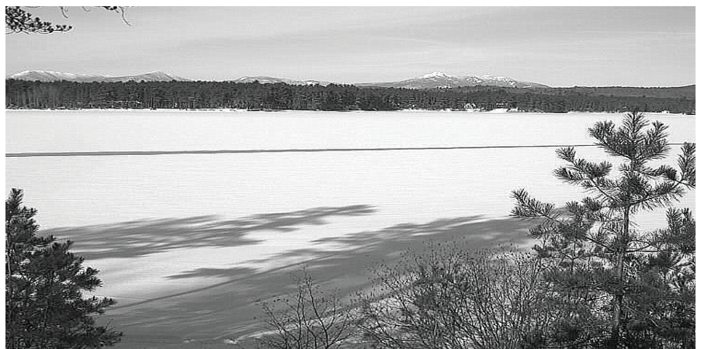
There was early ice this year, followed by sleet, snow and freezing rain as winter made its presence felt on Ossipee Lake just before the holidays.