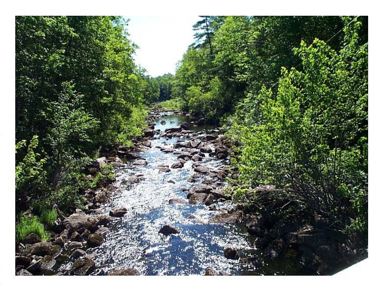
Water flows from the big lake through the bays and empties into this narrow Ossipee River channel, southeast of Berry Bay. From here, it flows through Maine to the Atlantic Ocean.

The limits of human intervention are tested regularly on the lake. A case in point occurred in December, 2003 when the lake level was down and there was a thick sheet of ice. Substantial rainfall on top of heavy snow caused the water to rise to over 407' feet. The dam was open but the level remained high for several days and the ice sheet blew into dock structures and other objects along the shore.