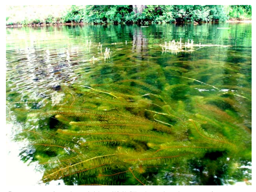
Large mass of exotic variable milfoil fills the swimming area of a property on Danforth Pond. Divers are likely to be used to hand-harvest the invasive weed to control its spread.

"The composition of the lake's sediment is