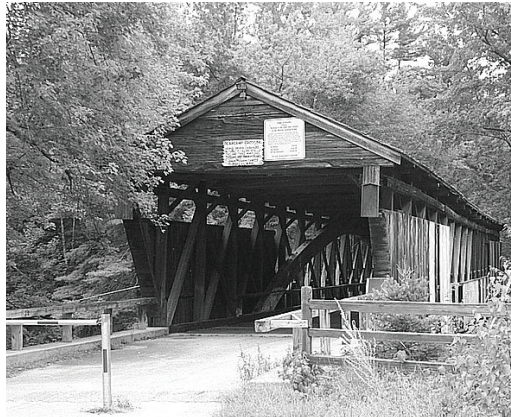
Ossipee's most important historic monument is in danger of collapse.